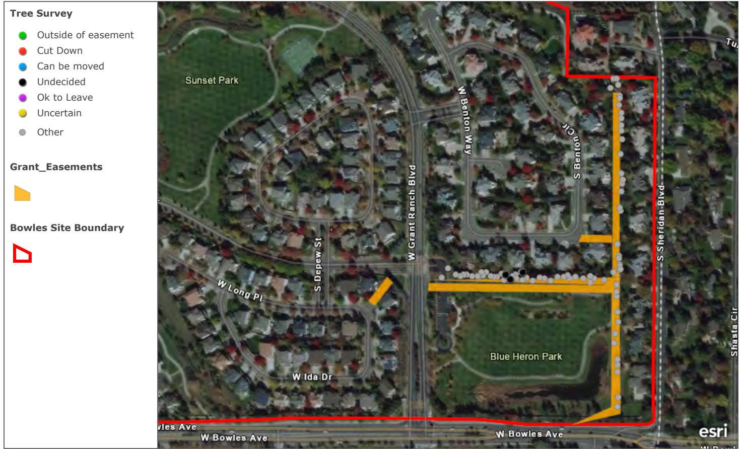
Primary map to feed primary app. Includes village boundaries, property, bus stops, and parcel information

USDA FSA | Esri Community Maps Contributors, City of Littleton, County and City of Denver, Jefferson County, CO, BuildingFootprintUSA, Esri, HERE, Garmin, SafeGraph, INCREMENT P, METI/NASA, USGS, EPA, NPS, US Census Bureau, USDA