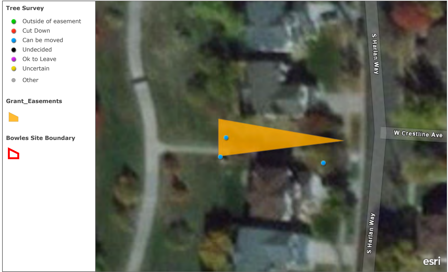
Primary map to feed primary app. Includes village boundaries, property, bus stops, and parcel information

Microsoft | Esri Community Maps Contributors, City of Littleton, County and City of Denver, Jefferson County, CO, BuildingFootprintUSA, Esri, HERE, Garmin, SafeGraph, INCREMENT P, METI/NASA, USGS, EPA, NPS, US Census Bureau, USDA