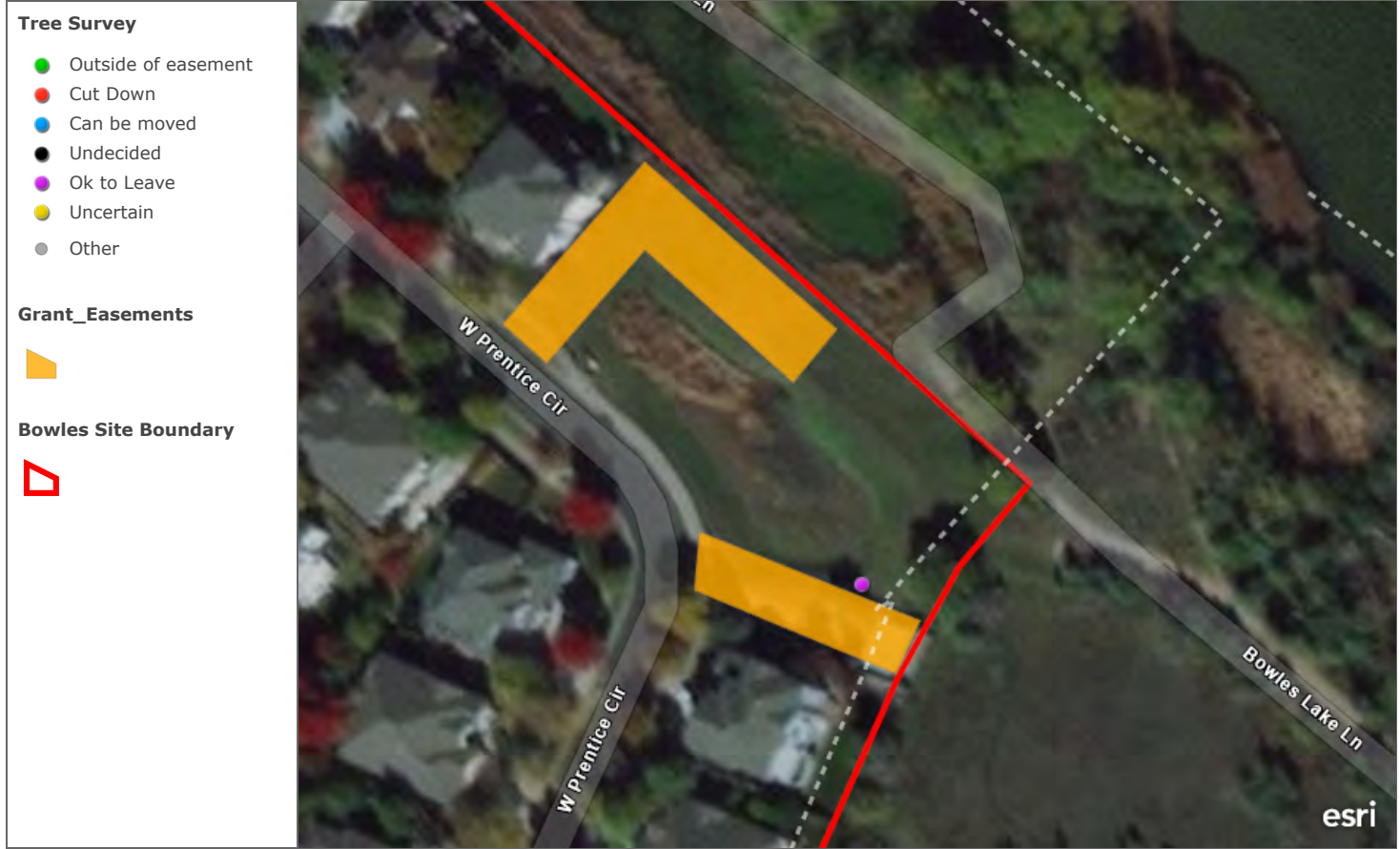
Primary map to feed primary app. Includes village boundaries, property, bus stops, and parcel information

Microsoft | Esri Community Maps Contributors, City of Littleton, County and City of Denver, Jefferson County, CO, BuildingFootprintUSA, Esri, HERE, Garmin, SafeGraph, INCREMENT P, METI/NASA, USGS, EPA, NPS, US Census Bureau, USDA