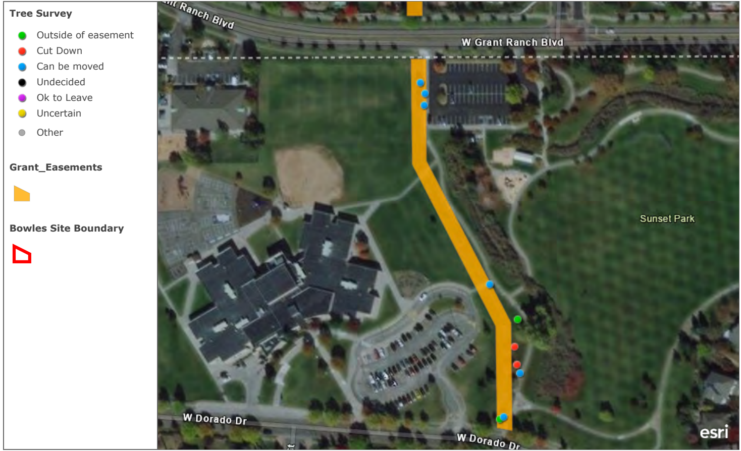
Primary map to feed primary app. Includes village boundaries, property, bus stops, and parcel information