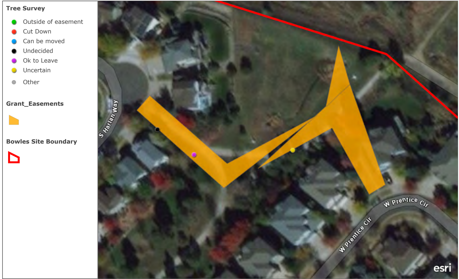
Primary map to feed primary app. Includes village boundaries, property, bus stops, and parcel information